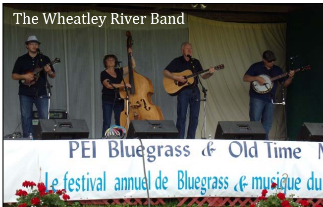
The Wheatley River Band