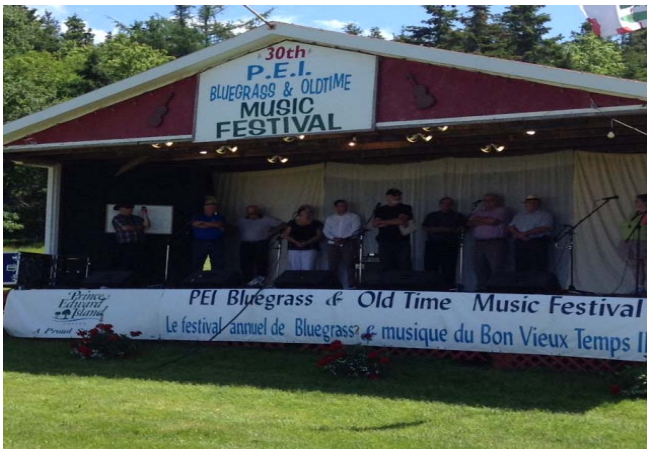
The official opening ceremony for the 30 th Annual Rollo Bay Bluegrass Festival.