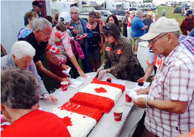
Everyone joining in for Canada Day celebrations to help kick off the festival