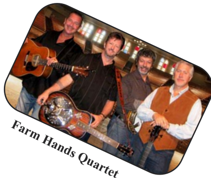
Farm Hands Quartet

Island bands will be added in due course according to availability.