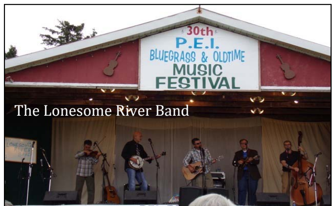
The Lonesome River Band