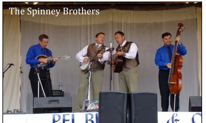
The Spinney Brothers